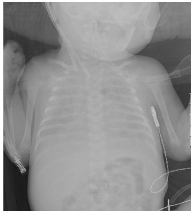
Figure 1 Chest radiograph. Persistent image of bilateral reticulogranular pattern after 2 weeks of ECMO.

After death lung and skin biopsies were performed, with written consent from the parents. The lung biopsy revealed chronic pneumonitis of the infant (Fig. 2).