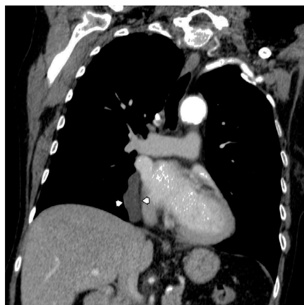
Figure 2 CT sagittal view shows the tubular cystic lesion laterally to the inferior vena cava, extending from the level of the right inferior pulmonary vein to the diaphragm.

Few reports in the literature have described air within the pulmonary ligament, post-traumatic or from ruptured