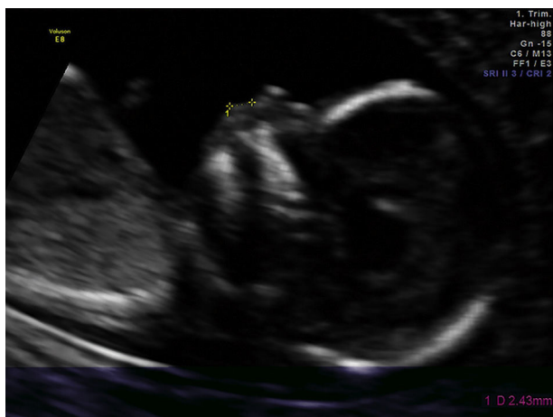
Fig. 1 – Sonographic measurement of the philtrum length at 13 weeks of gestation.

The fetal philtrum assessment was made only once during pregnancy in a routine ultrasound evaluation after written informed consent. For all examinations the mid-sagittal plane was obtained only by a single operator. The FPL was measured with electronic callipers from the posterior border of the columella to the top of the upper lip, as described by a previous study 12 (Fig. 1).