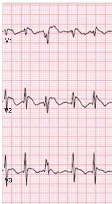
Figure 3 Type 1 Brugada phenocopy electrocardiogram in V1-V3, in the context of hypophosphatemia. Retrieved from Meloche et al. 80 .