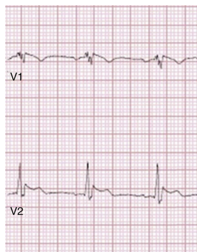
Figure 4 Type 1 Brugada phenocopy electrocardiogram in V1 and type 2 Brugada phenocopy ECG in V2, in the context of electrocution. Retrieved from Wang et al. 85 .

created to establish an online international database of BrP cases to allow for longitudinal follow-up of these conditions and to develop a better understanding of BrP 74 . Notably, a recent report of recurrent hypokalemia demonstrated clinically reproducible BrP, contributing to the evolution of the concept 79 .