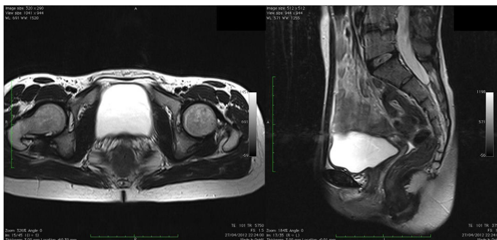
Figure 1 Axial and sagittal pelvic magnetic resonance imaging, showing aplasia of the uterus and the upper part of the vagina.

ASD, especially ostium secundum type, is a common congenital heart defect in adults. It occurs as a result of defective development of the interatrial septum. Most