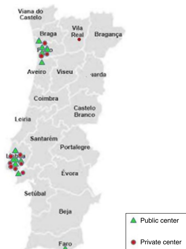
Figure 2 Cardiac rehabilitation centers in Portugal in 2014.

As found in previous surveys, all centers have multidisciplinary teams, and all include a cardiologist. There is