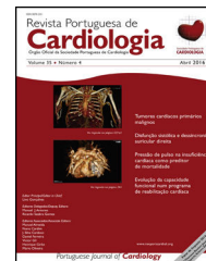
IMAGE IN CARDIOLOGY