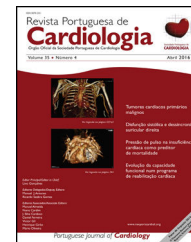
IMAGE IN CARDIOLOGY