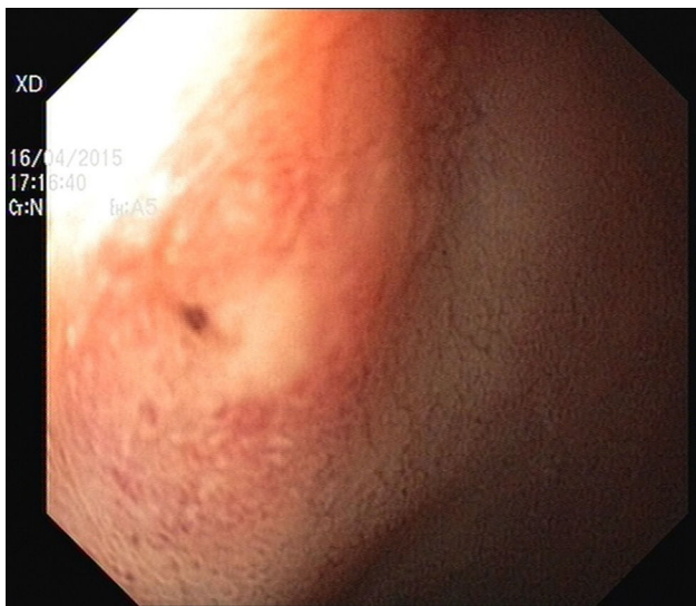
Figure 2 Fistulous opening in the antero-superior duodenal bulb wall.

the literature. The possible mechanism of the liver abscess secondary to fish bone migration from the duodenum it's the creation of a duodenohepatic fistula covered by duodenal serosa. 2 Since the first reported case, treatments usually