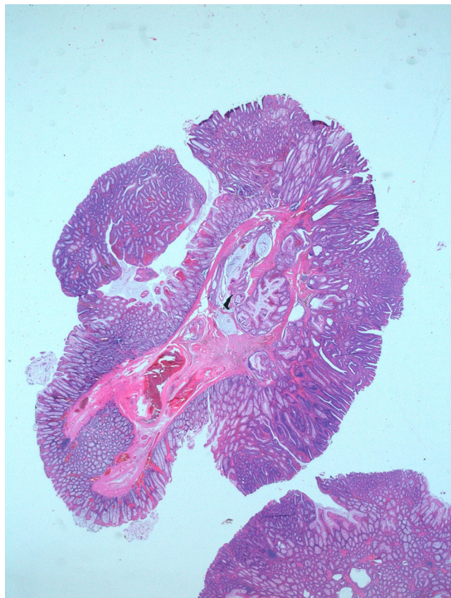
Figure 1 Aggregates of dilated and slightly irregular glands in the submucosa, in connection with the overlying mucosa (scanning microscopy).

a gap in the muscularis mucosae; bland cytology and architecture with frequent cystic dilation of the glands; signs of recent hemorrhage or hemosiderin deposition; typical localization in the sigmoid colon. Additionally, no morphological aspects of neoplastic epithelium (as desmoplasia, frank atypia or pleomorphism) should be seen. 1,3