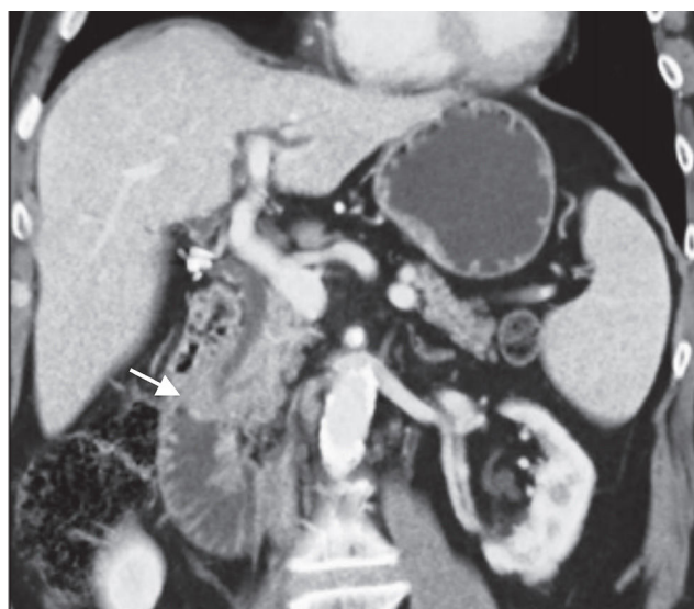
Figure 1 Computed tomography showed an ampullary mass with 13 mm suggestive of ampullary adenoma.

A 59-year-old female was admitted to the emergency department with mucocutaneous jaundice associated with pruritus. No dark urine, acholic stools, abdominal pain, fever, anorexia or weight loss were present. Personal history included systemic lupus erythematosus (treated with hydroxychloroquine sulfate and mycophenolate mofetil), type 2 diabetes mellitus non-insulin treated and a breast lump (detected about a month ago in breast cancer screening mammography) under investigation (histology ongoing). The laboratory tests showed an obstructive pattern with total bilirubin 9 mg/dL, direct bilirubin 6.4 mg/dL, aspartate aminotransferase 126 IU/L, alanine aminotransferase 208 IU/L, gamma glutamyl transpeptidase 796 IU/L, alkaline phosphatase 726 IU/L and negative inflammatory parameters. Blood tumor markers (cancer antigen 19.9 and carcinoembryonic antigen) were within normal ranges. The abdominal ultrasound study was limited by bowel gas interposition but allowed view marked dilatation of intrahepatic